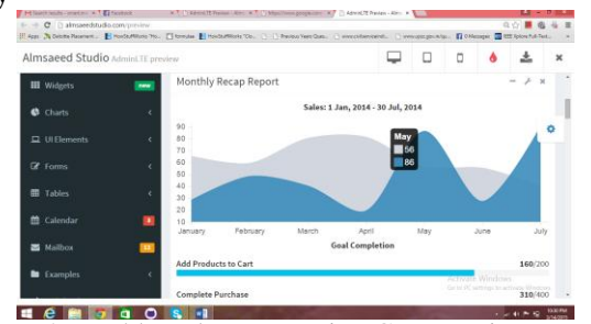
Figure 2: Dashboard Representing Comparative Reports for better Human Readability

Data visualization is viewed by many disciplines as a modern equivalent of visual communication. It is not owned by any one field, but rather finds interpretation across many (e.g. it is viewed as a modern branch of descriptive statistics Data vi Data visualization or data visualization is viewed by m Data visualization or data visualization is viewed by many disciplines as a modern equivalent of visual communication. It is not owned by any one field, but rather finds interpretation across many (e.g. it is viewed as a modern branch of descriptive statistics by some, but also as a grounded theory development tool by others). It involves the creation and study